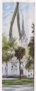
St. John's Cathedral Savannah, Georgia