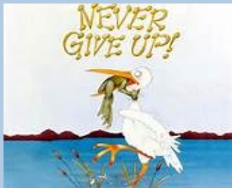
Taken from "Personality Disorders: A Class of Their Own"