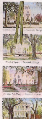
Savannah Scene #1 Savannah, Georgia