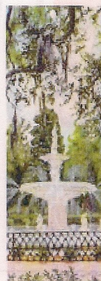
Forsyth Park Savannah, Georgia