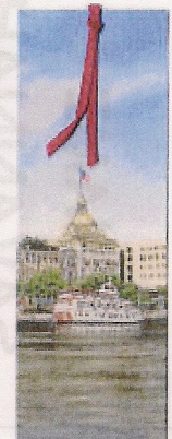
Savannah Waterfront Savannah, Georgia