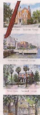
Savannah Scene #2 Savannah, Georgia