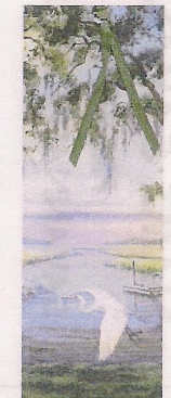
Yellow Bluff on Ashley Creek