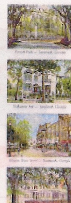
Savannah Scene #3 Savannah, Georgia