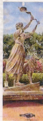
Savannah's Waving Girl Savannah, Georgia