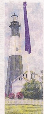
Tybee Island Light Tybee Island, Georgia