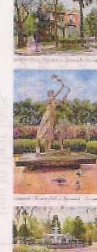
Savannah Scene #4 Savannah, Georgia