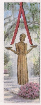
Bonaventure Cemetery Savannah, Georgia