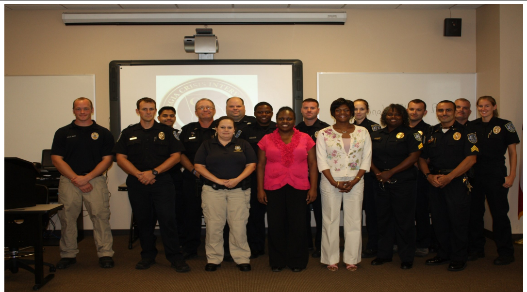
CIT Graduates from Savannah-Chatham Metropolitan Police, Airport Security, Probation

On September 16- 20, 2013, NAMI -Savannah held the last CIT training for the year. Fifteen new CIT officers graduated. Thank you to all of our professional instructors and for Recovery Place, American Work, Reed House and Georgia Regional for providing site visits. It truly takes a community to provide this outstanding training.